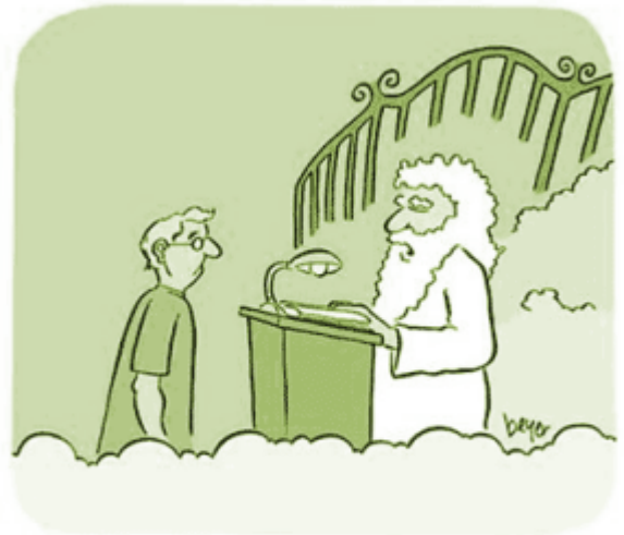
"Username and password, please."